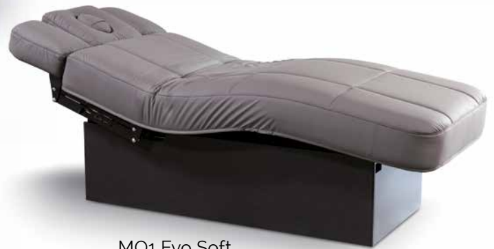
MO1 Evo Soft