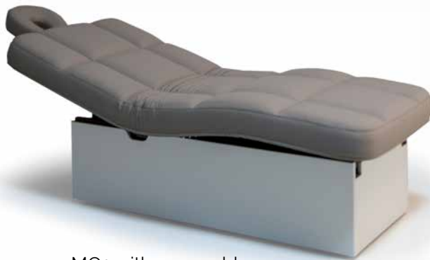
MO1 with removable face cradle and without armrests